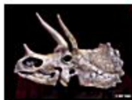
Detailed Accurate TRICERATOPS SKULL 1/10Scale