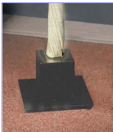
Optional base - click to enlarge

Shaft reputed to be of UNICORN HORN is actually from a NARWHAL TUSK