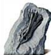
Exact Cast CRINOID FOSSIL - Ultimate Survivor