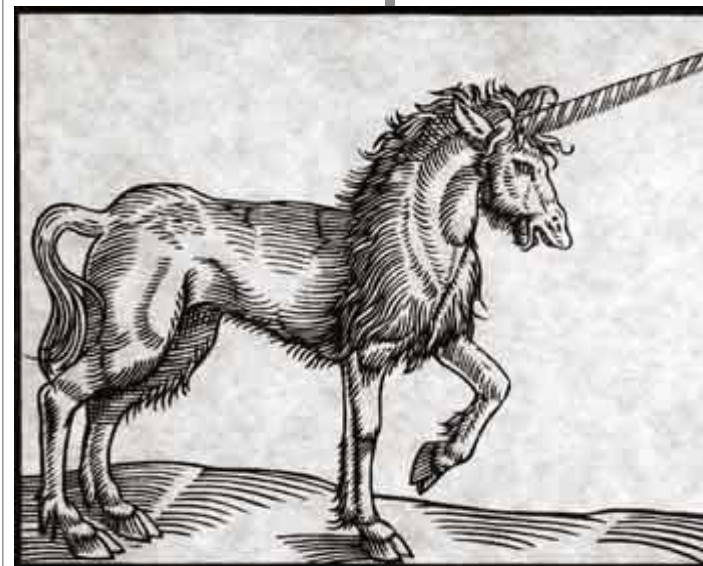
German Woodcut of UNICORN, 1551 A