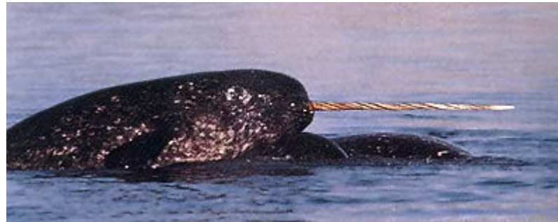
Photograph of a NARWHAL