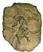
Archaeopteryx Fossil FIRST BIRD or DINOSAUR ?