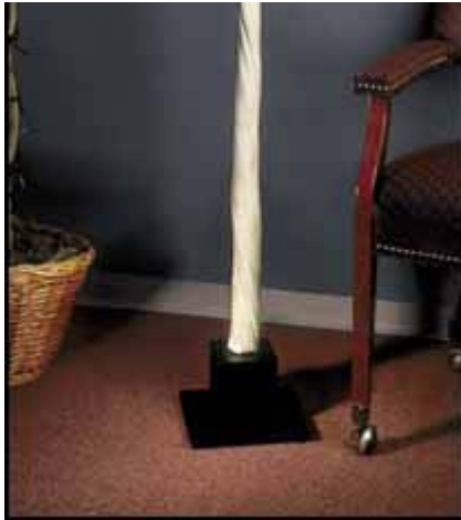
NARWHAL TUSK with OPTIONAL Custom FLOOR Mount