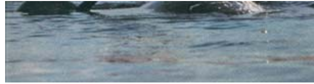
Narwhals at Play