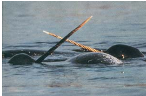
Narwhals at Play

Time: c. 1978 Location: Arctic Circle Location: Inuit Indians