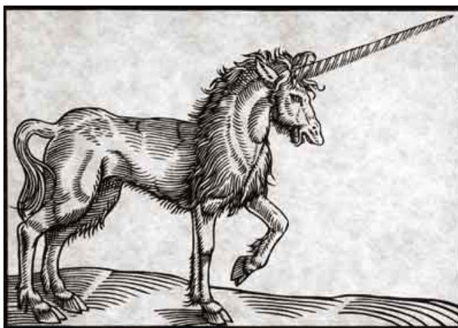
German Woodcut of UNICORN, 1551 AD