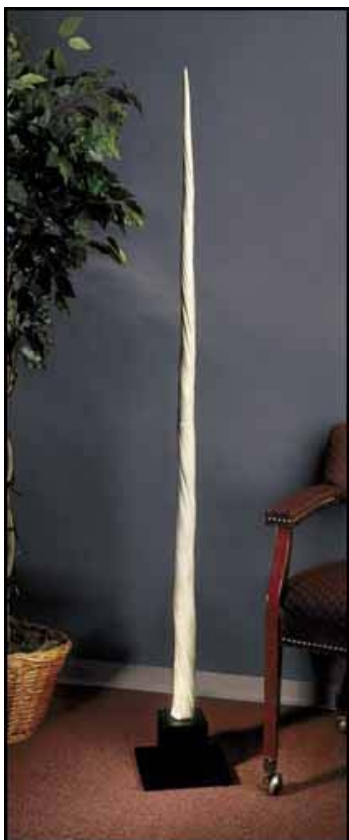
NARWHAL TUSK with OPTIONAL Custom FLOOR Mount

VERY LIMITED EDITION only 20 EVER CREATED !