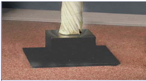
Optional base - click to enlarge