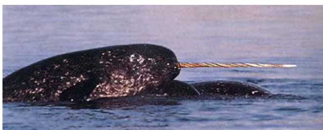
Photograph of a NARWHAL